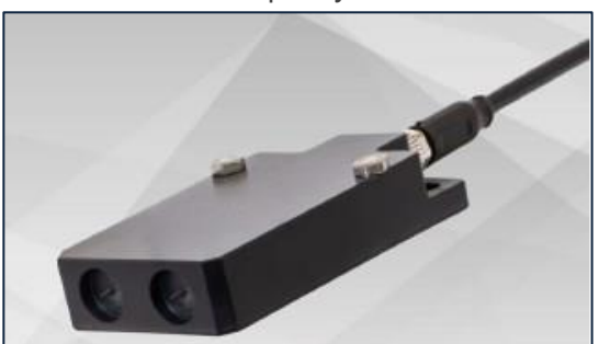
Static neutralization to meet the requirements of high-performance machinery at close range. Integrated Power Supply requires only a low voltage 24V DC input.

An ultra-compact 24 V DC Static Eliminator, ideal for installation in areas where space is at a minimum. Powerful, compact and easy to install.