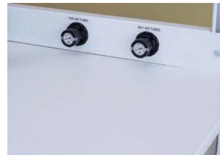
Dual Regulator Knobs